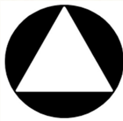
Sign for use at a light color door